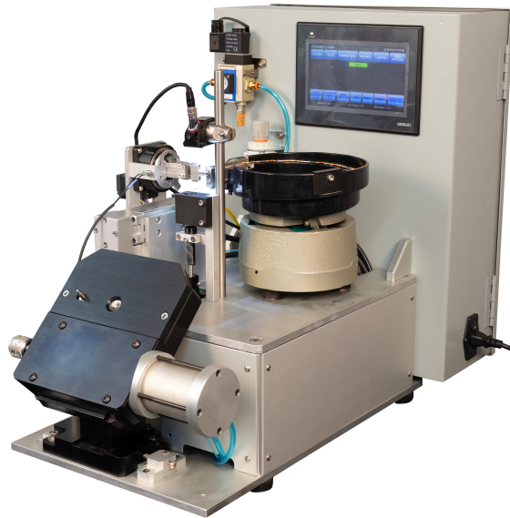
Model TAC ULTRA

Tri-Star Technologies, a wire processing equipment company, is excited to present our latest Automatic Crimp System, the TAC Ultra. With its new photo optic controlled escapement system, the TAC Ultra can accommodate both shouldered and shoulder-less contacts in a single feeder bowl design. Previously this capability required multiple feeder bowls or multiple TAC systems. All operations of the TAC Ultra are managed by a simple HMI display.